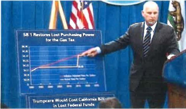
Governor Jerry Brown at budget press conference

Compared with the previous year, the governor's $124 billion general fund spending plan for California makes a few augmentations in critical areas, calls for some reductions, and also proposes new approaches and cautions. In his press conference, Governor Brown reminded us that "there have been ten recessions and ten recoveries since World War II," and that "while we have a modestly improved fiscal outlook since January," we must always plan for the next recession, further noting that "even a recession of moderate intensity