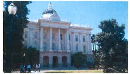
State Capitol building