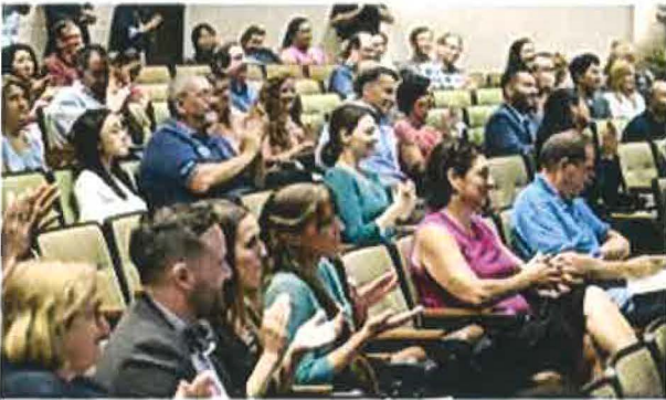
Miramar College Convocation