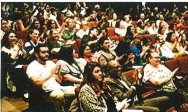
City College Convocation