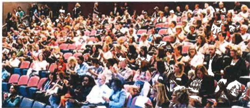
Continuing Education Convocation