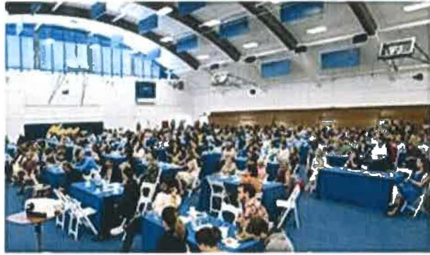
Mesa College Convocation